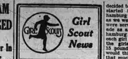
Girl Scout News