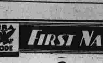
Girl Scout News