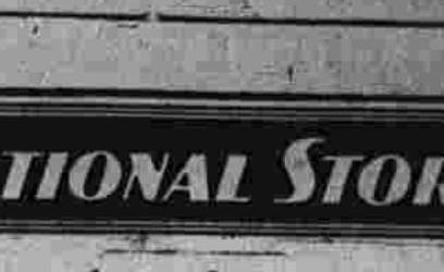
Girl Scout News